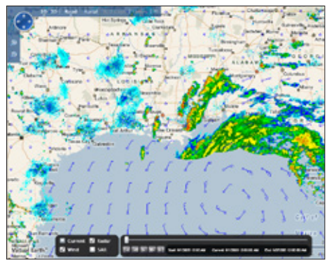
Environmental Common Operational Picture (ECOP) with EDS real-time weather data fed into WMS layer